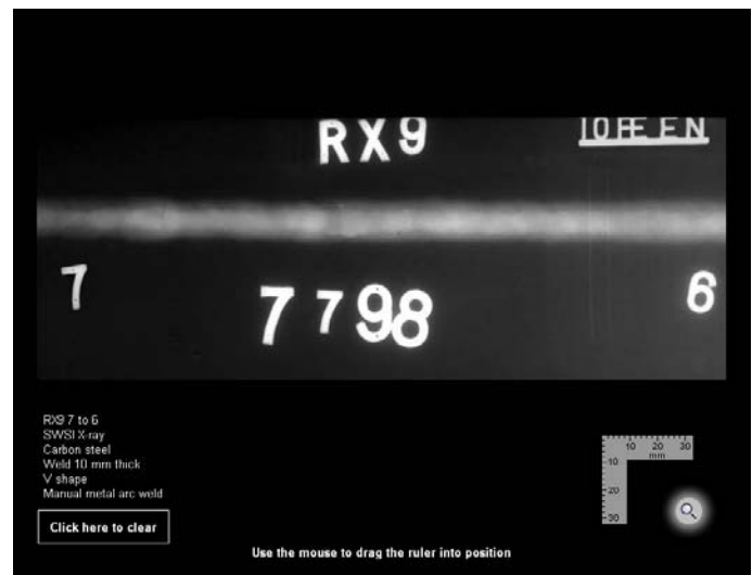
(Fig 3: Viewing a radiograph)

The film density can also be checked via a density measurement tool to ensure it complies with recognised standards.